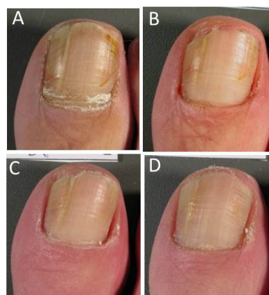
Figure 1. Photographic sequence showing target nail appearance at baseline (Panel A), at Week 2 (Panel B), Week 4 (Panel C) and Week 8 (Panel D) for a patient with onychomycosis of moderate intensity at baseline.